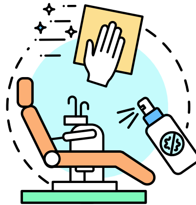
Washing Chairs Between Patients